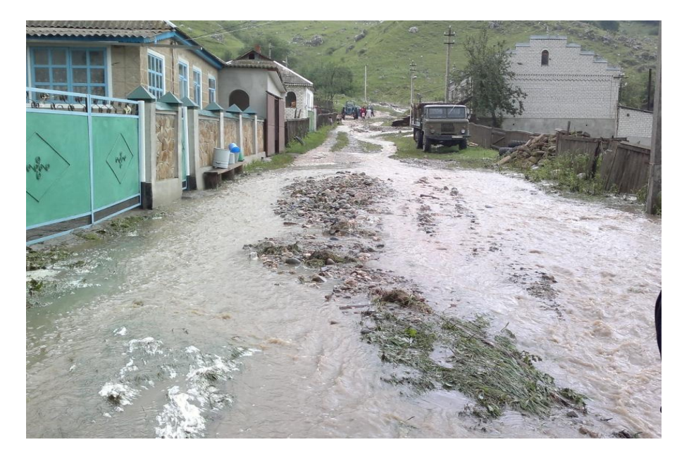
Figure 1 – Mudflows inPregradnayast.

Transformation of the environment under the influence of natural processes and human activities is characterized for mountainous areas. Anthropogenic transformation of mountain landscapes takes place along large river, creating of man-made environment, development of mineral deposits and agricultural areas. Karachay-Cherkessky Republic is an example of a region where exogenous geological processes and active human activity shows itself very quickly. The territory of the Urupsky region of the Karachay-Cherkessky Republic is located in the mountainous part of the Northern slope of Big Caucasian ridge. Due to the complexity of the terrain and climatic characteristics of the region, there are places subjected to dangerous exogenous geological processes. Mudflows in the Urupsky District occur in the mountainous areas where terrain slope angles total 50-90°. Such settlements as Urup, Kyzyl-Urup, Phiya, Rozhkao are often subjected to effects of mudflows (Figure 1).