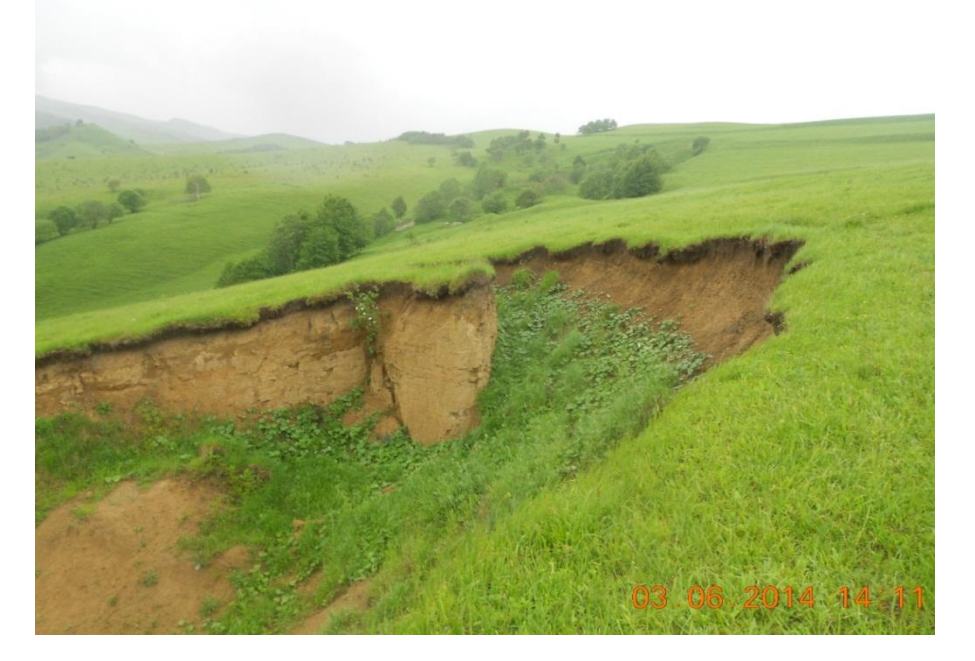
Figure 2 –Landslide processes inornithological reserve

In the area of the Pregradnayastanitsa a landslide-stream was active during heavy rains and it could transform into a mudslide, threatening to local population. For the environment, the landslides of Urupsky district may be of a direct threat only in the form of destruction of land within the ornithological reserve in stanitsaPregradnaya and destruction of agricultural, grazing areas(Figure 2).